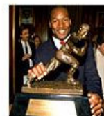
Heisman Moments: Closest Finishes