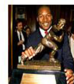
Heisman Moments: Closest Finishes