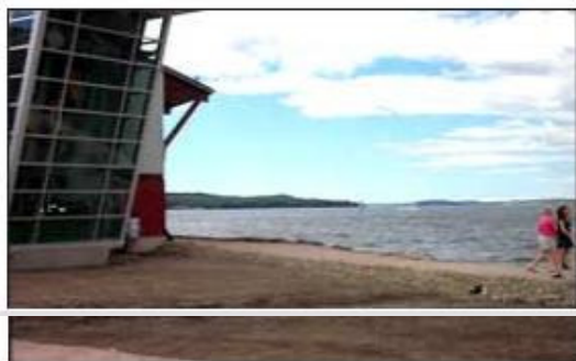
The Georgian Bay neighbours the new Bobby Orr Hall of Fame.