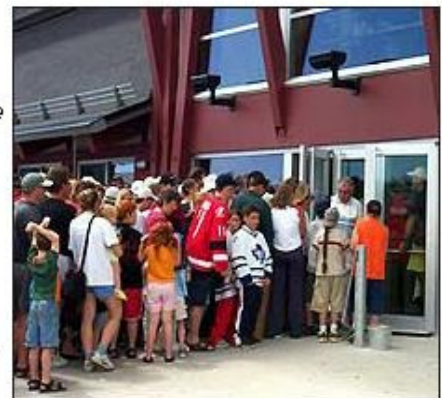
Fans jammed into the Hall all afternoon long.