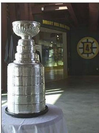
The Bobby Orr Hall of Fame is located in the Stockey Centre, right on the banks of gorgeous Georgian Bay. The Stanley Cup sits poised, ready to look around at the amazing artifacts that chronicle Bobby's life and career.