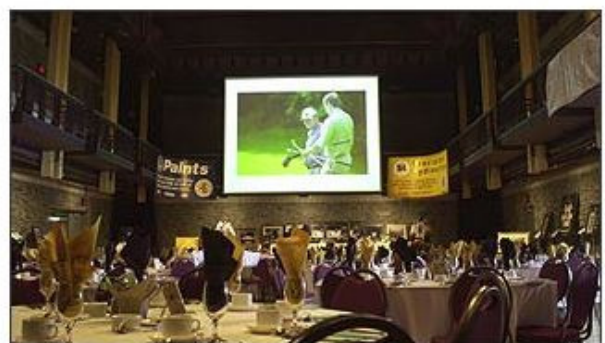
The incredible Charles W. Stockey Centre was the setting for dinner for the 5th Annual Bobby Orr Hall of Fame Celebrity Golf Classic.