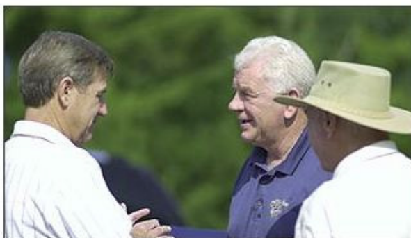
Two of Parry Sound's finest hockey exports joined up on the links for a few pleasantries and a whole lot of stories. Bobby Orr sets the ground rules on emceeding his event to Terry Crisp (right).